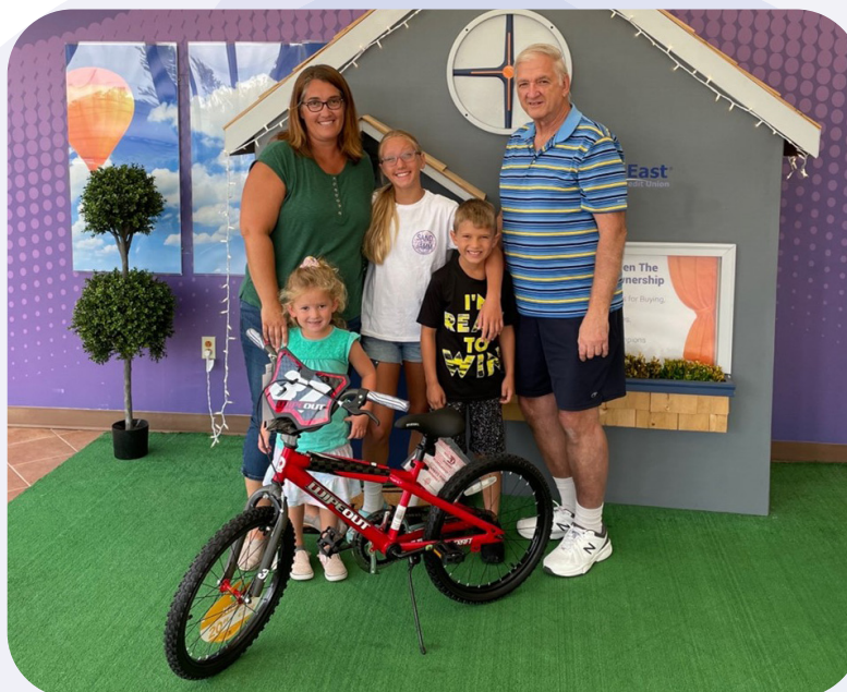
Bicycle winners from Aston's Community Day Event

Also in 2023, we worked with Cherry Bekaert as our internal auditor to further assure that Sun East followed and met all of the Credit Union's policies and procedures. The results of these audits continue to prove that your Credit Union is well managed, financially strong, and operating under the highest of standards.